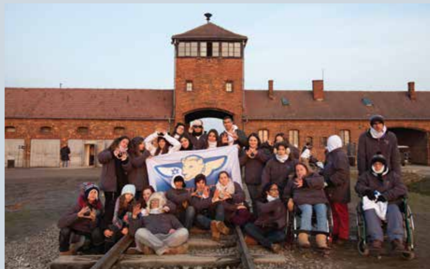
Delegation to Poland