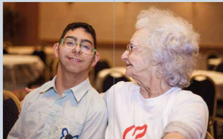
In the Community