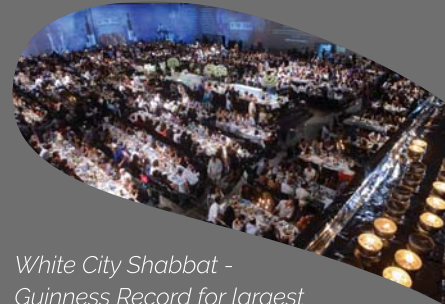
White City Shabbat - Guinness Record for largest Shabbat dinner in June 2014.

AYF has a following of 60,000 people. Together, we build community through leadership, education and Jewish action in Israel. Hospitality and communal Shabbat dinners are where community begins to form, and spreads across every part of the city, attracting all young Jews. White City Shabbat brings together people from all walks of life for a dose of traditional chicken soup and good company, into a unified, non-denominational community.