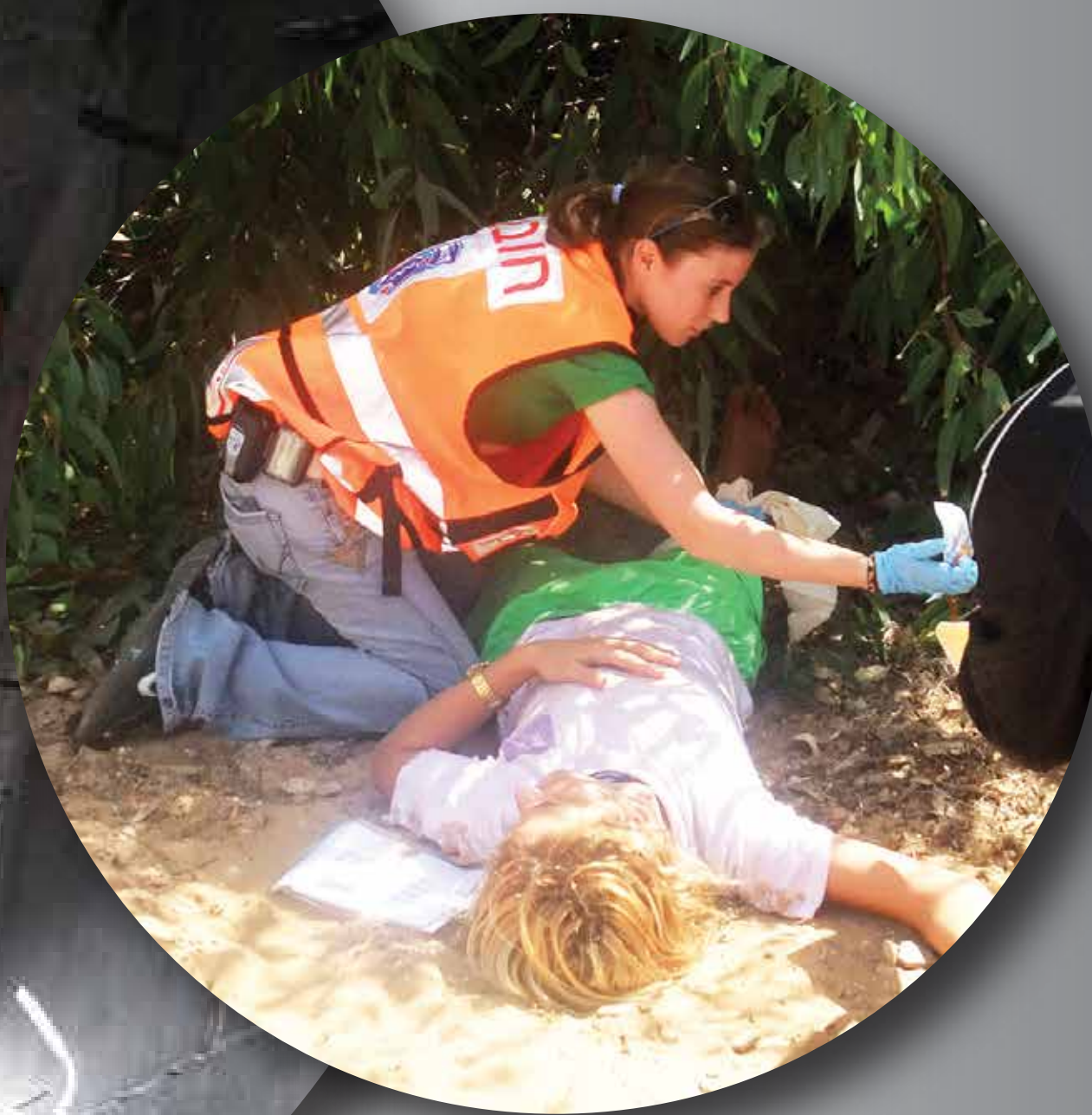
A day in the lives of our volunteers.